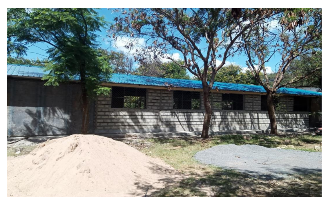
Roofed section of the rehabilitated workshop