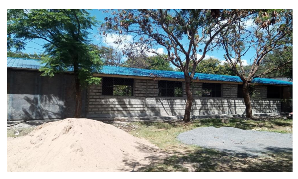
Roofed section of the rehabilitated St Joseph Polytechnic's Production Department