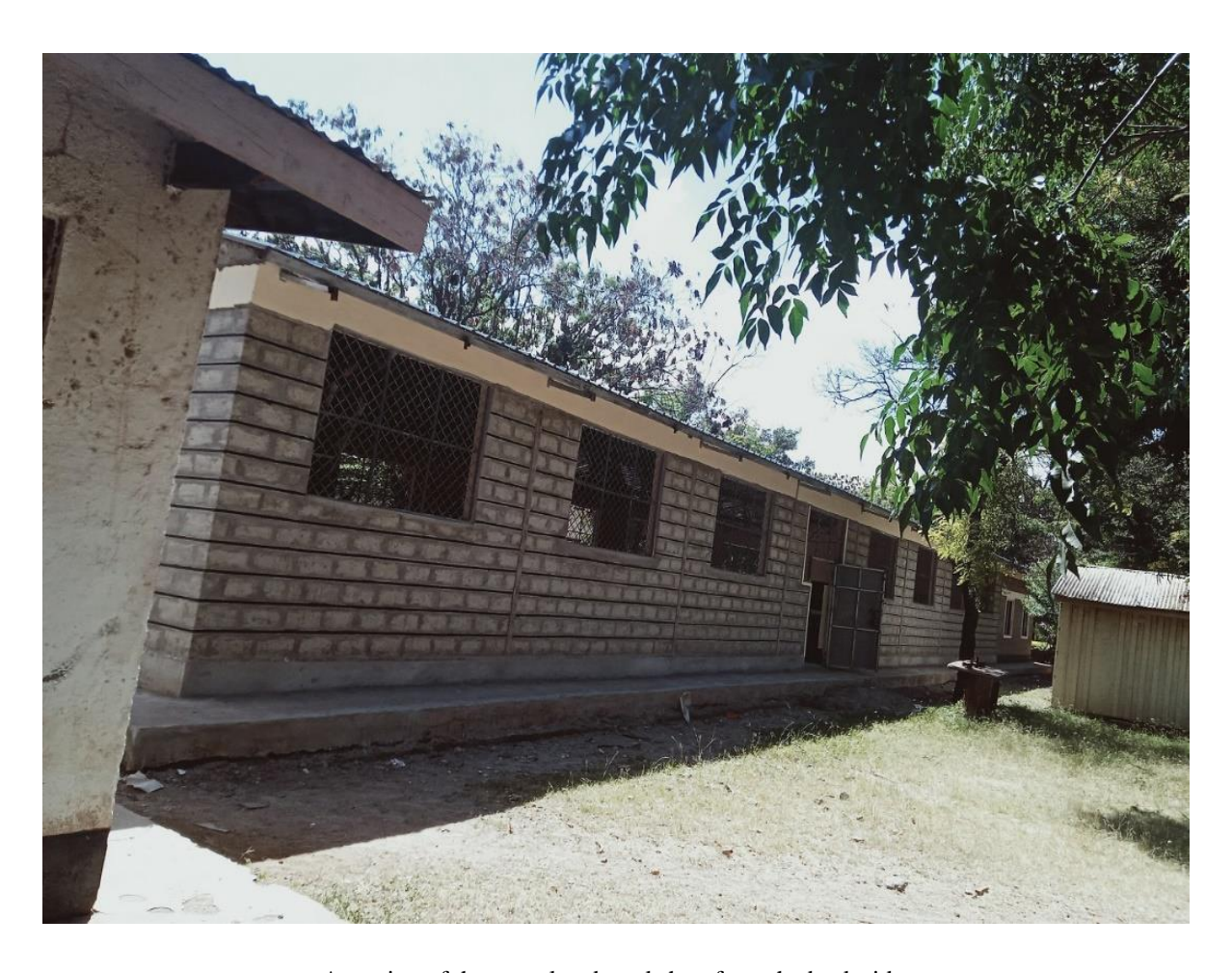
A section of the completed workshop from the back side.