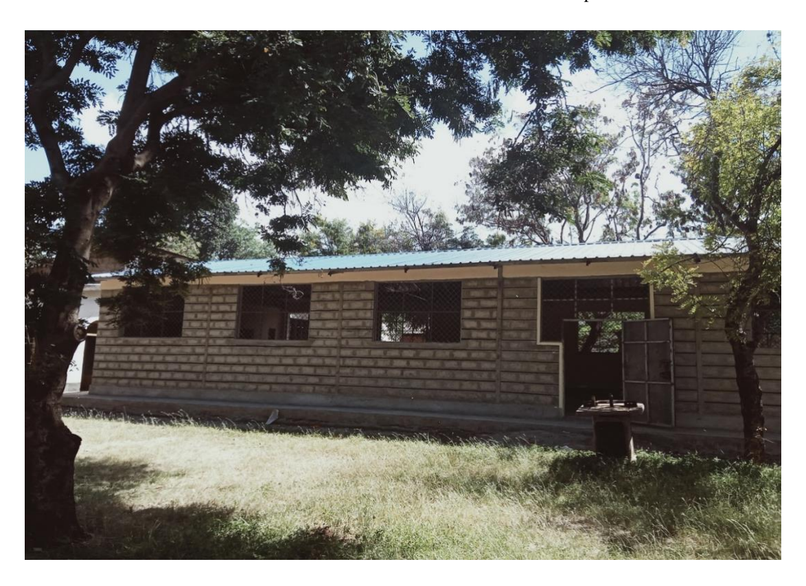
A section of the completed workshop from the front side.